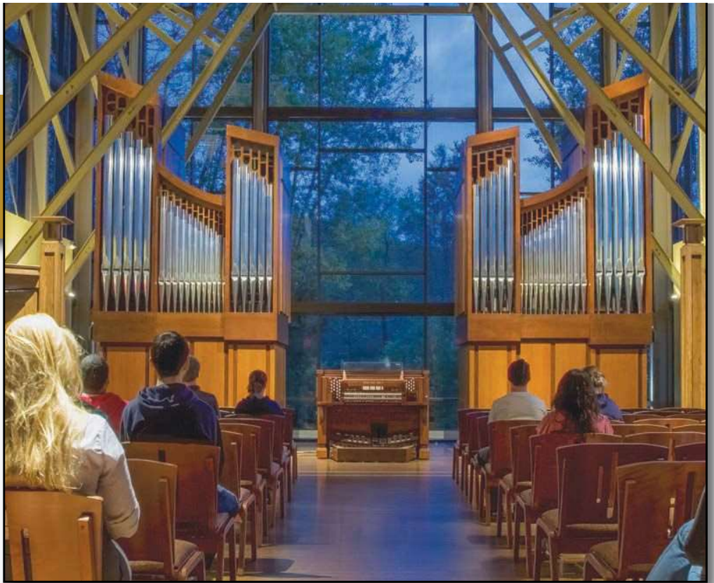
Harriett B. Wick Chapel, University of Pittsburgh-Bradford. This 17-rank instrument was built in 2010.