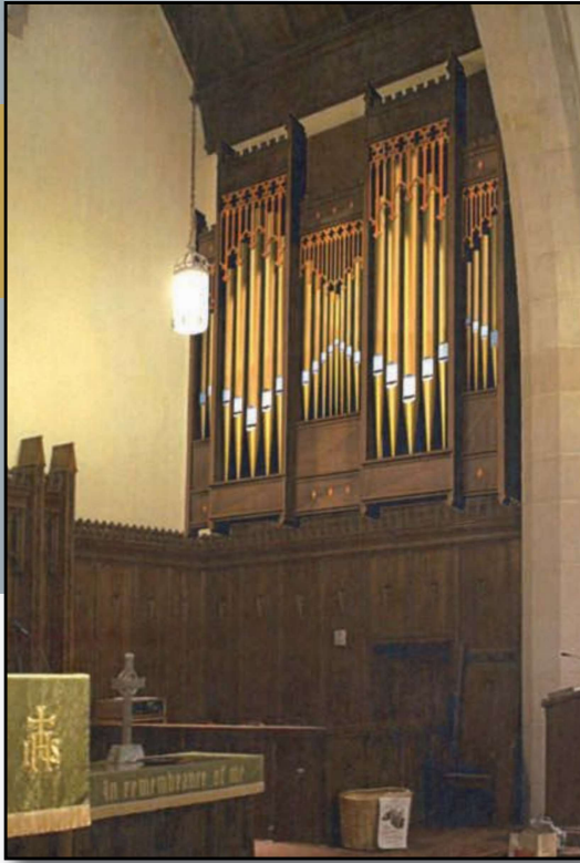
Sistersville Presbyterian Church, Sistersville, West Virginia. This II/26 instrument was built in 2014.